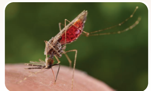
An adult female mosquito bites a person.