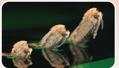
An adult mosquito emerges from a pupa.