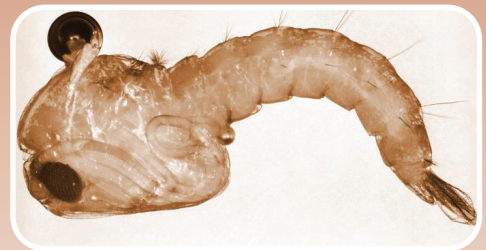
Pupae live in the water.