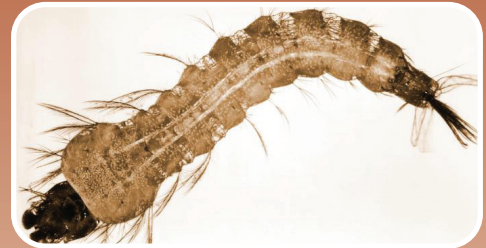
Larvae live in the water.